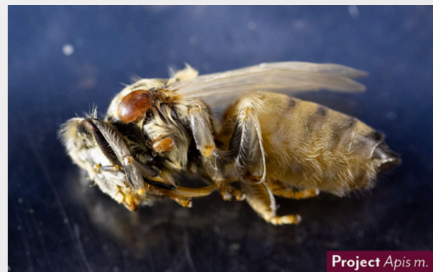
Honey bee with T. mercedesae , and V. destructor .

The life cycle of Tropilaelaps mites is similar to that of Varroa mites; they reproduce in capped brood cells in the colony, and feed primarily on the hemolymph of honey bee brood. Both mites vector viruses, such as deformed wing virus (DWV). While Varroa mites can feed on adult bees, it is believed the mouthparts of Tropilaelaps cannot penetrate the exoskeleton of an adult bee. As a result, Tropilaelaps mites cannot survive on adult bees for more than 2–3 days and require constant access to brood to feed and reproduce.