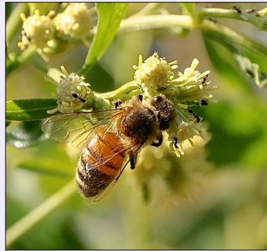
Honey bee and ants on male flowers

Baccharis halimifolia A member of the Asteraceae family, sometimes called groundsel tree or saltbush ... Take a look up close and see the remarkable variety and quantity of insects visiting the flowers.