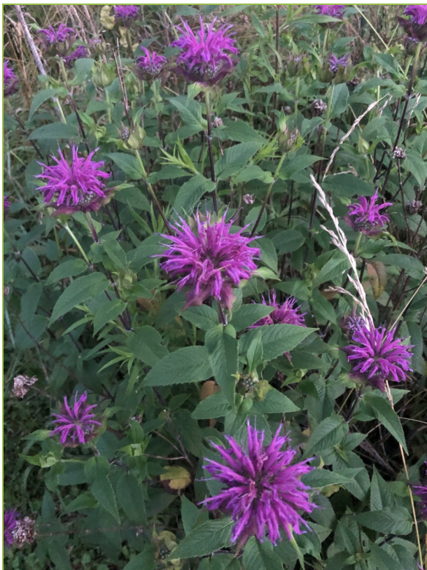
Bee balm, Monarda Photo by Cynthia Pierce, Mebane, 6/17/2020.