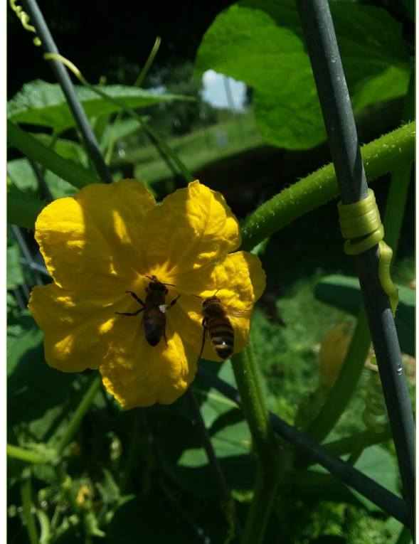
Honey bees on cucumber blossoms! in Snow Camp, 6/21/2020.