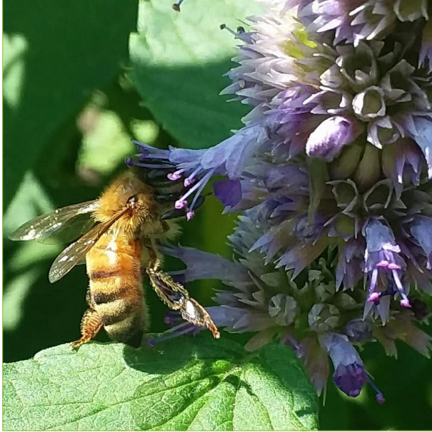
Honey bee on anise hyssop , Agastache foeniculum . Photo by Jennifer Welsh in Snow Camp, 6/21/2020.