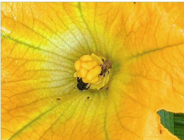
Zucchini flower with honey bee, black Two-spotted Long-horned bee, and fruit flies!