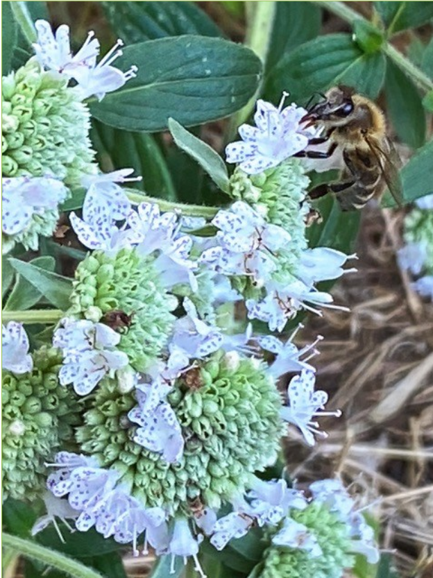
Hairy mountain mint, Pycnanthemum pilosum