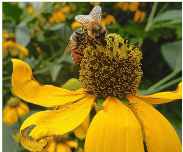
Cutleaf coneflower, Rudbeckia laciniata