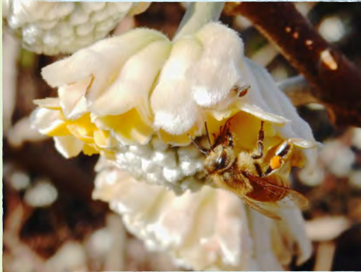
Left: Gathering pollen on Paper Bush, Edgeworthia chrysantha .